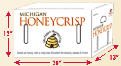
Master Tray Carton (please contact your supplier)