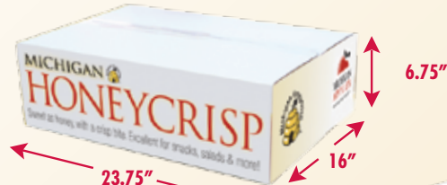
Euro Carton (please contact your supplier)